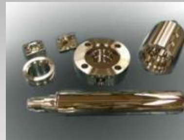
Hyper pure water pump parts