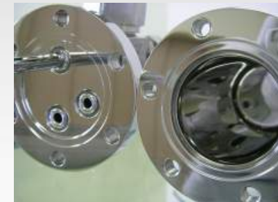
Low degassing surface (AL • SUS chamber)