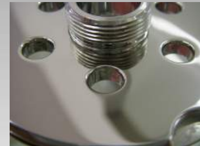
Anti-corrosive, anti-discharge surface